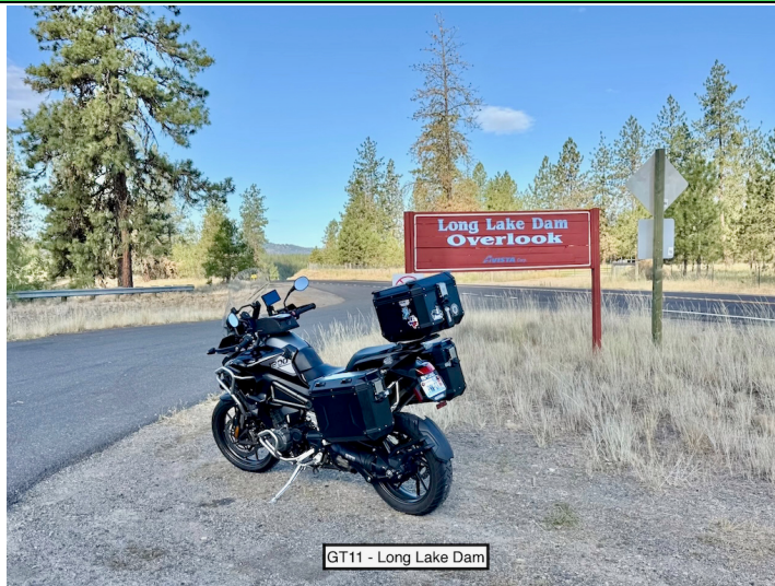
GT11 - Long Lake Dam

Notes Long Lake Dam lays on the Spokane River west of Spokane on one of the better roads out of town. It is a concrete gravity hydro dam that stands 223 feet high and is about 725 feet across. The overlook provides a great view of the dam.