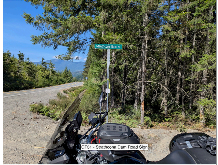
GT31 - Strathcona Dam Road Sign