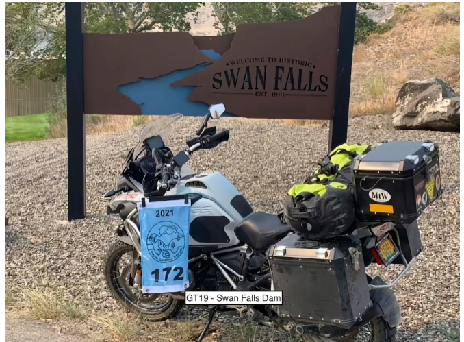
GT19 - Swan Falls Dam

There are some really great views of the dam, Snake River and canyon on your way down to the dam.