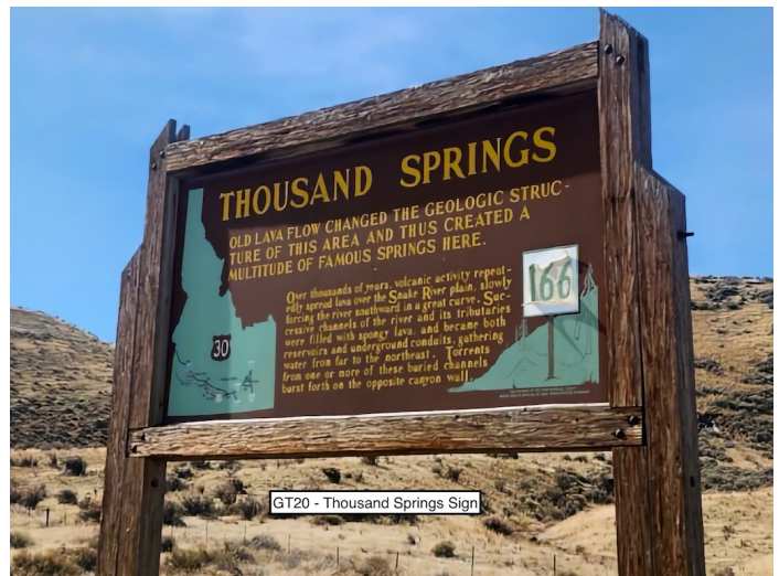
GT20 - Thousand Springs Sign

The Malad River Gorge dam is located at N42.86366, W114.88475 if you want to brave the dirt road and take a look.