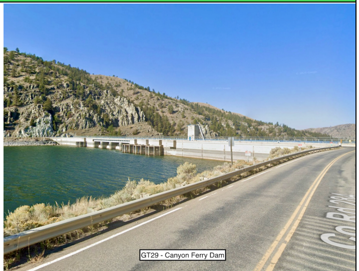
GT29 - Canyon Ferry Dam

Canyon Ferry Dam sits on the Missouri River. It is a concrete gravity dam. The creation of Canyon Ferry Lake submerged the historical town of Canton.