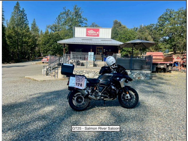
GT25 - Salmon River Saloon

Cecilville is pretty remote and while there is a gas station shown in town on Google Maps, it usually only operates Friday - Sunday. Gas up before you head towards this stop!