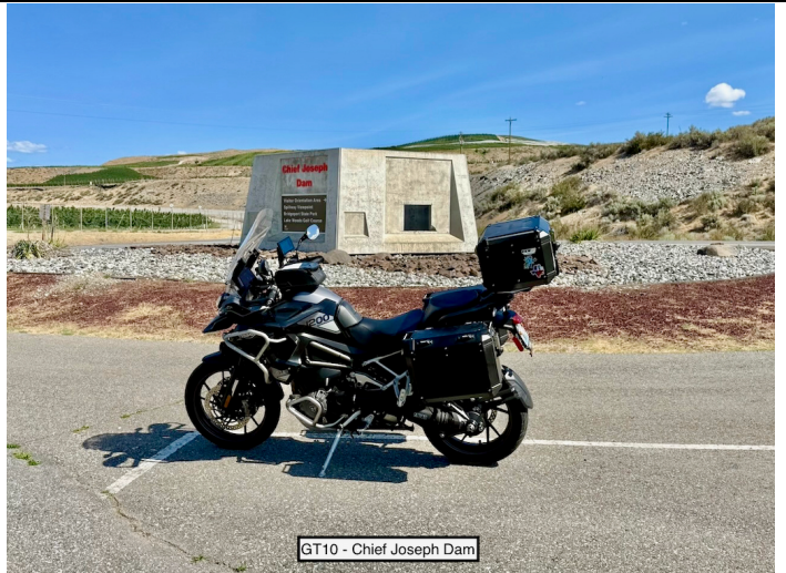
GT10 - Chief Joseph Dam

Notes Chief Joseph Dam sits on the Columbia River. It is a concrete gravity hydro dam that stands about 236 feet tall and is about 5,600 feet across. Chief Joseph is the second largest power producer in the US - only Grand Coulee exceeds it.