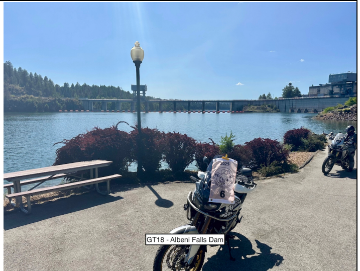
GT18 - Albeni Falls Dam

Albeni Falls Dam sits on the Pend Oreille River and is used to generate electricity and provide flood control. The dam is a concrete structure 90 feet tall and about 1,000 feet long.