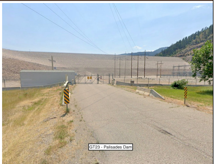
GT23 - Palisades Dam

The sample picture is from the area at the bottom (downstream) of the dam. There is an access road off of US-20 to get there.