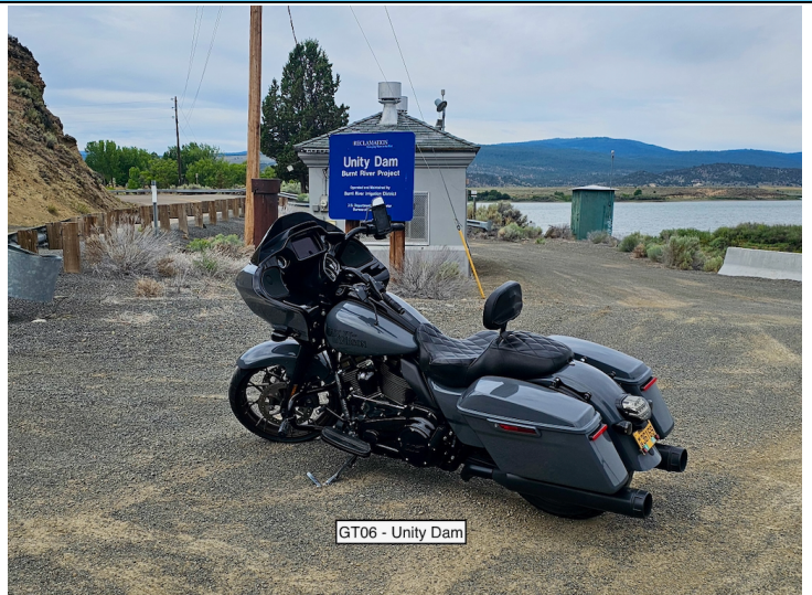
GT06 - Unity Dam

Unity Reservoir is formed by Unity Dam on the Burnt River. It is an earth-fill dam about 82 feet high and 694 feet long.