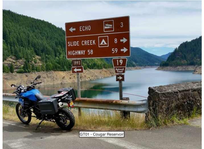
GT01 - Cougar Reservoir

Cougar Dam forms Cougar reservoir on the south fork of the McKenzie River. It is a rock-filled embankment dam that stands 519 feet tall and about 1,600 feet wide.