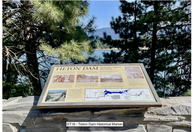
GT16 - Tieton Dam Historical Marker

Tieton dam is an earth fill embankment irrigation dam that stands about 262 feet tall and is about 1,110 feet across.