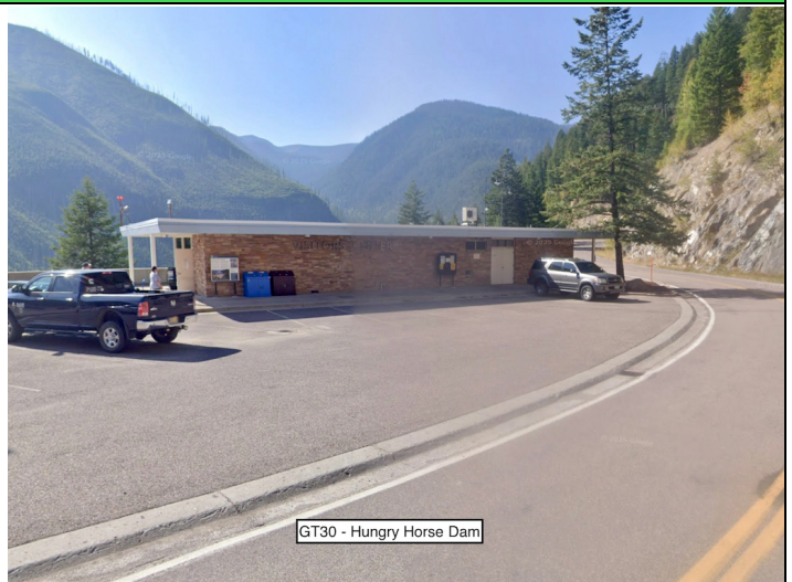
GT30 - Hungry Horse Dam

Hungry Horse Dam sits on the south fork of the Flathead River and forms Hungry Horse Reservoir. It is a large concrete arch dam that stands roughly 564 feet tall - the tallest in Montana and one of the tallest in the US.