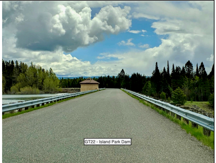
GT22 - Island Park Dam

Island Park Dam sits on the Henrys Fork of the Snake River and forms Island Park Reservoir. It is a zoned earth fill dam that is 94 feet tall and roughly 9,500 feet long.