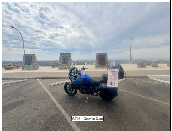
GT26 - Oroville Dam