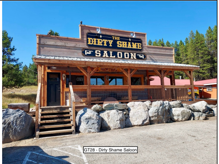
GT28 - Dirty Shame Saloon

No dam nearby, but the ride will be a very fun trip!