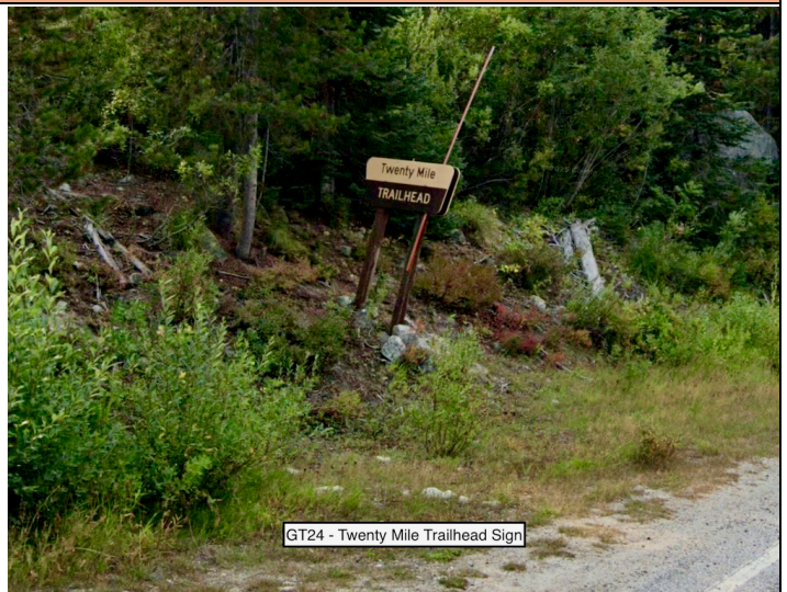
GT24 - Twenty Mile Trailhead Sign

No, there isn't a dam nearby. But it is beautiful up in this area and we really wanted you to go!