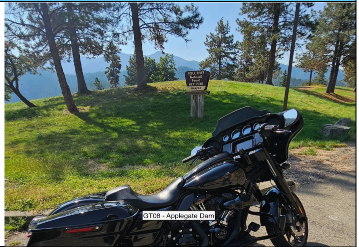
GT08 - Applegate Dam

The sign is located at the turn into the view point. The dam lays on the Applegate River and forms Applegate Lake. It is a large rockfall embankment dam about 242 feet high and 1,300 feet long.