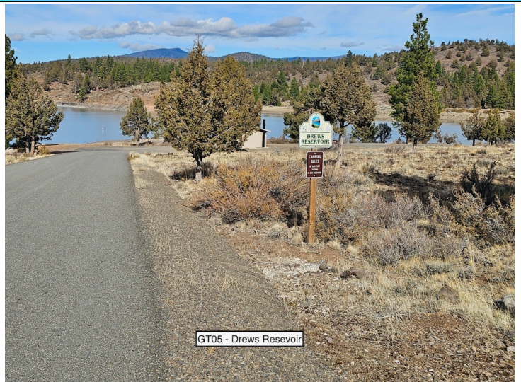
GT05 - Drews Reservoir

Drews Reservoir is formed by Drews Dam, a small rock-fill irrigation dam. The dam is about 60 feet tall and 600 feet long.