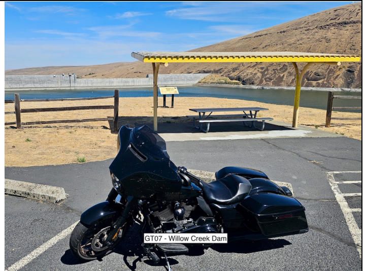
GT07 - Willow Creek Dam

OR-74 is a rider's favorite and should be a blast! Willow Creek Dam forms Willow Creek Lake on Willow Creek...see a trend here??? It is a concrete dam about 160 feet high and about 1,780 feet long.