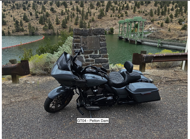
GT04 - Pelton Dam

Pelton Dam forms Lake Simtustus on the Deschutes River. The dam is a concrete arch hydro dam that stands about 204 feet tall and is about 965 feet long. Go a little farther south on Pelton Dam Road for a good view of Herbers Canyon.