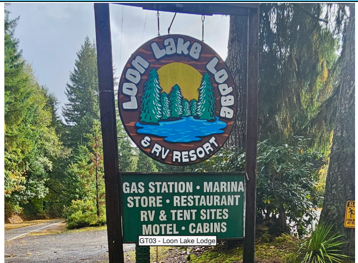
GT03 - Loon Lake Lodge

Loon Lake was formed by a landslide about 1,400 years ago. Not a man-made dam, but a dam nonetheless!