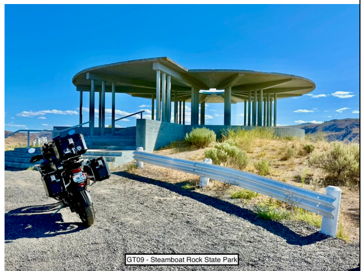
GT09 - Steamboat Rock State Park

Grand Coulee Dam is a concrete gravity hydro dam that stands 550 feet tall and is about 5,223 feet across!