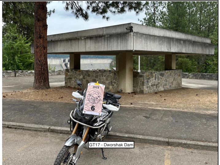
GT17 - Dworshak Dam

Dworshak Dam lays on the north fork of the Clearwater River and forms Dworshak Reservoir. It is the third tallest dam in the US at 717 feet and is roughly 3,287 feet long. Continue up the road to the visitor center for great views of the dam.