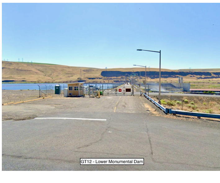
GT12 - Lower Monumental Dam

Notes Lower Monumental Dam lays on the Snake River. You can ride across the dam, but there are some restrictions and it may only be an option between 7:30 and 4:30. We are giving you the option of taking a picture from either side the dam. The dam is a concrete gravity hydro dam that stands 100 feet high and is about 2,248 feet across.