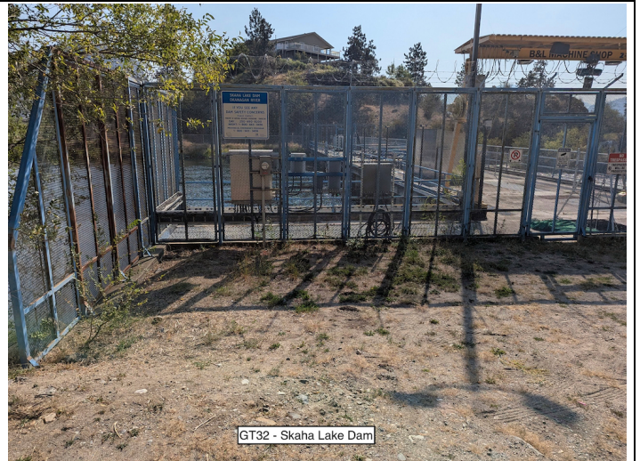
GT32 - Skaha Lake Dam