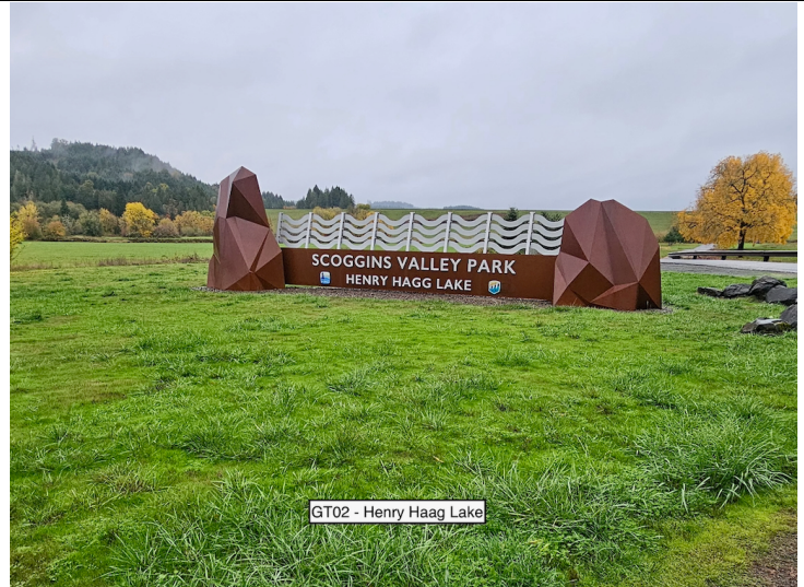
GT02 - Henry Haag Lake

Henry Hagg Lake is formed by the Scoggins Dam and is a popular recreation area for local fishermen. Scroggins Dam is a earth-fill embankment dam that stands about 151 feet high and is about 2,700 feet long.