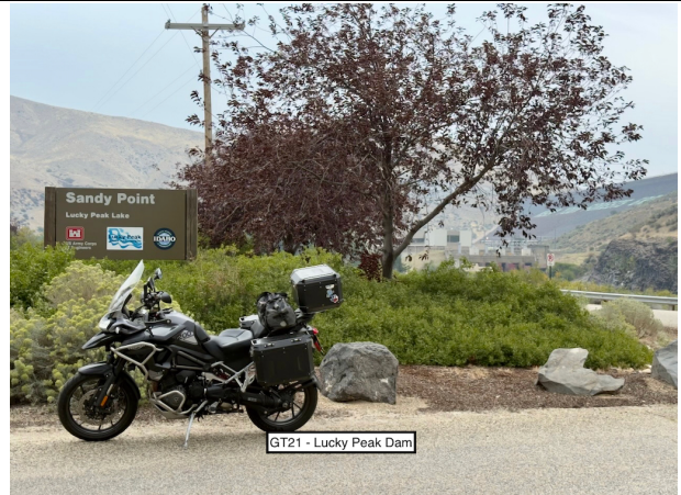
GT21 - Lucky Peak Dam

Lucky Peak Dam sits on the Boise River and forms Lucky Peak Lake. It is a rolled earth fill embankment dam that is about 250 feet tall and 1,700 feet long.