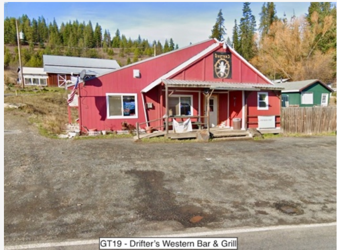
GT19 - Drifter's Western Bar & Grill

Notes Not the quick way through the panhandle, but definitely the scenic way. Combine this with the first two Idaho stops for a good day of riding.