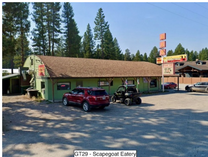
GT29 - Scapegoat Eatery

Another stop along a different section of MT-200 that wanders through the southern part of the Flathead National Forest.