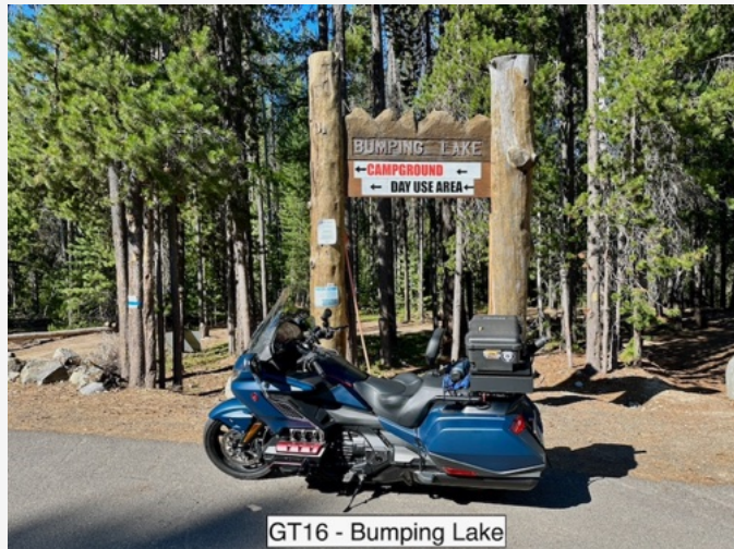
GT16 - Bumping Lake

The road is in good shape but some frost heaves make it bumpy in spots. 40 mph was a good speed on a Wing. There is lots of camping along the river and dirt roads beyond the dam for you adventure types.