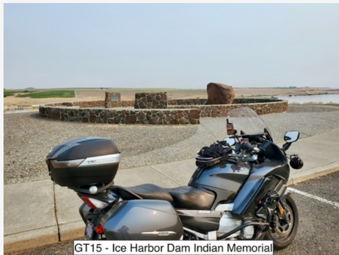
GT15 - Ice Harbor Dam Indian Memorial