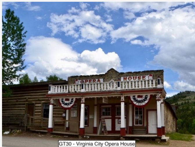
GT30 - Virginia City Opera House