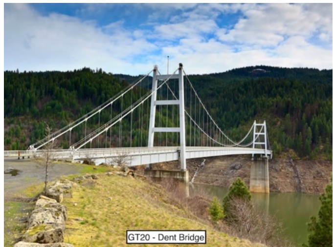
GT20 - Dent Bridge

Notes Dent Bridge crosses the Dworshak Reservoir just outside of Orofino. The road is paved from the Orofino (south) end. The road to the north has not been scouted and likely turns to dirt. Contributed by Ken Tracy