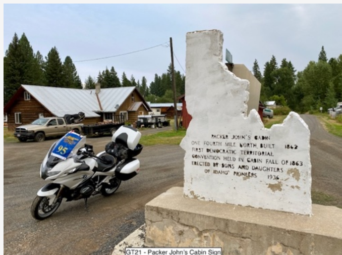
GT21 - Packer John's Cabin Sign

Notes Working your way south will bring you to a decision – take US-95 (it's not horrible) or ID-55 (this is your path). This cool little roadside stop is meant to remind you to veer east for the trip down to Boise.