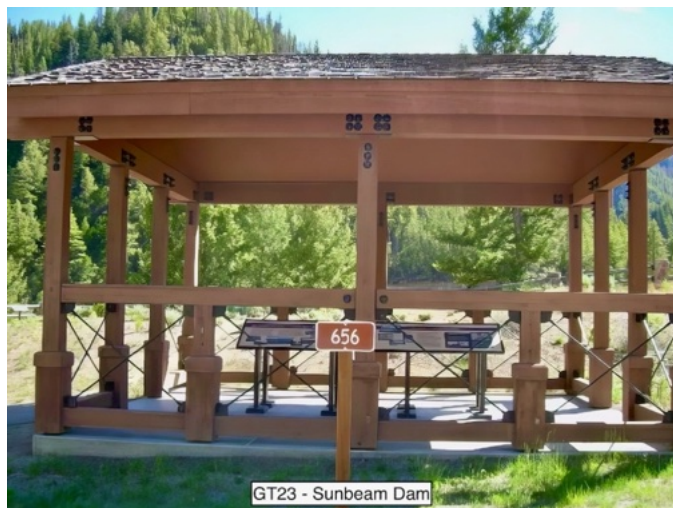
GT23 - Sunbeam Dam

This spot is located in a roadside parking area along ID-75. Anytime you can find a reason to ride ID-75 is a good day! Take a few minutes and follow the path down to the Salmon River for some nice views.