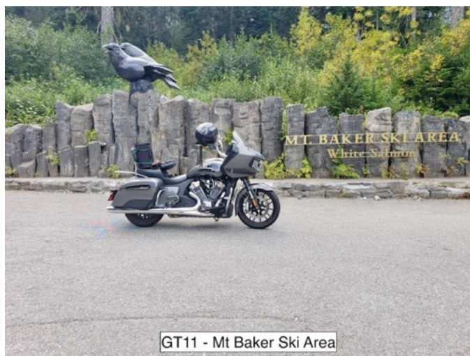
GT11 - Mt Baker Ski Area