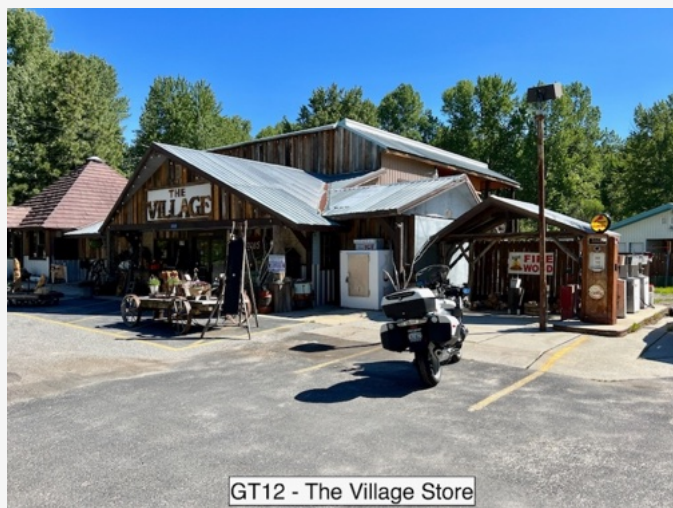
GT12 - The Village Store

Off US-2 and out towards Lake Wenatchee – fun roads and great scenery await you! Rumor has it that the store has treats that might be enjoyed on a nice, warm summer day.