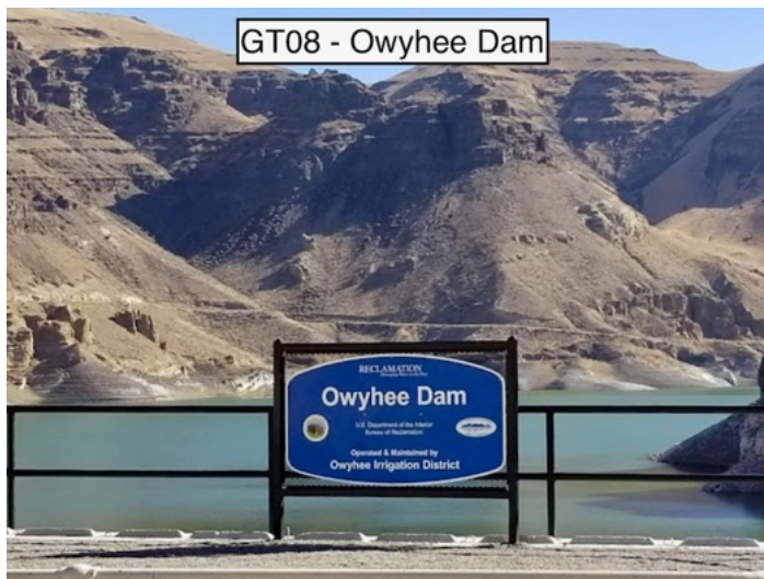
GT08 - Owyhee Dam

Notes The sign is located in a parking area on the west side of the dam. You will feel like you are in the middle of nowhere on your way out to the dam. **Note – the roads in this area are typical paved forestry service roads. Take your time and the occasional frost heave will not be an issue. Contributed by Ken Tracy.