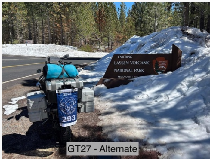
GT27 - Alternate

Do yourself a favor – if you haven't been to Lassen Volcanic National Park, take some time to ride through and enjoy one of the lesser known parks in our system. Even if you don't, you will enjoy the roads around the park!