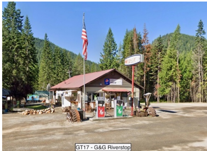
GT17 - G&G Riverstop

Idaho's panhandle offers some really good riding. Combine this stop with a few other Idaho stops for a tour of some of the best!