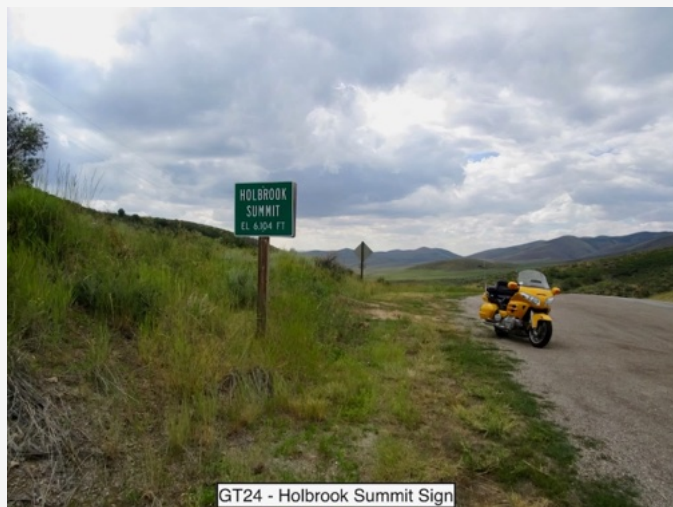
GT24 - Holbrook Summit Sign