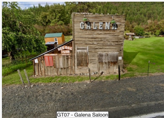
GT07 - Galena Saloon

Notes Galena could almost qualify as a ghost town if 1 or 2 people didn't actually live there...in any event, we are looking forward to enjoying the paved forestry service road to get there.