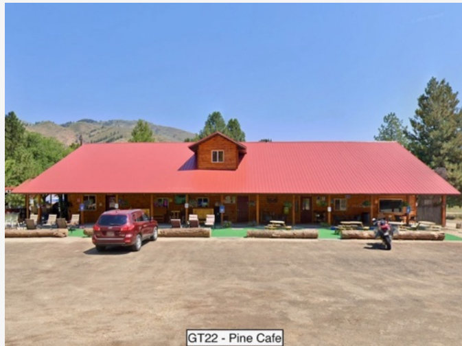
GT22 - Pine Cafe

A nice ride northeast of Mountain Home in the area around Anderson Ranch Reservoir. If you stop to eat here, let others know how it was 😊