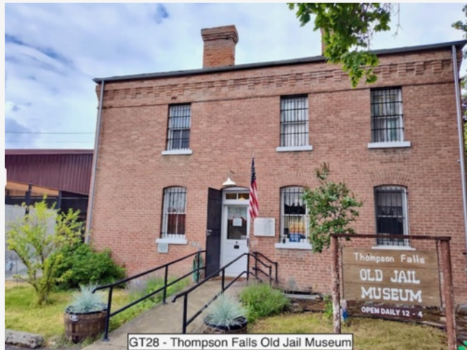
GT28 - Thompson Falls Old Jail Museum

MT-200 will take you through a beautiful valley surrounded by big mountains and the occasional bit of wildlife. Pair this one with GT17 for a fun ride!