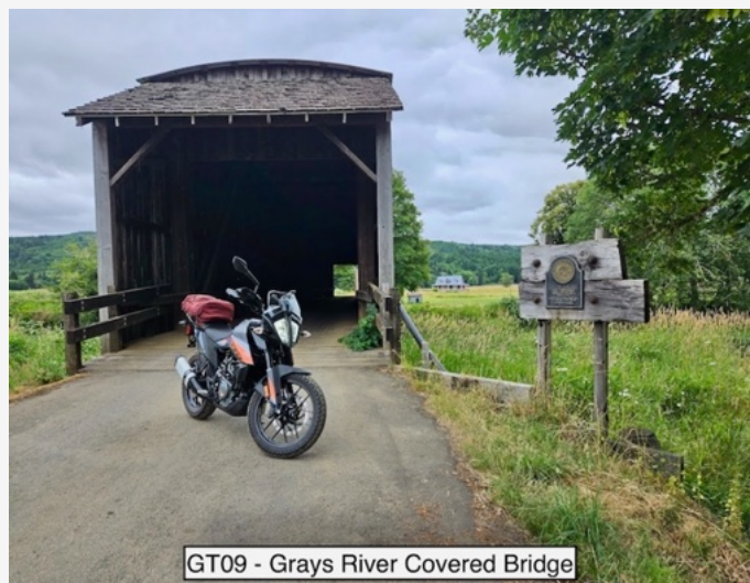
GT09 - Grays River Covered Bridge

Notes WA-4 is not a road most people take on purpose. There are quicker ways to get to the coast both north and south, but few are as scenic and enjoyable as this one!