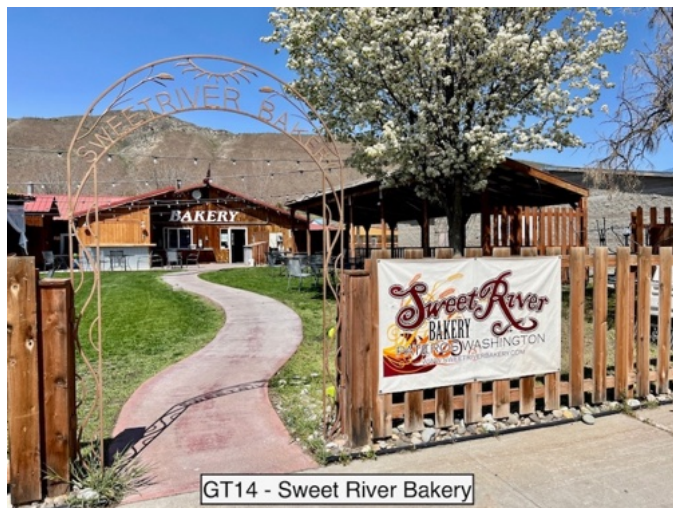
GT14 - Sweet River Bakery

This sign and gate is located on the backside (river side) of the restaurant.