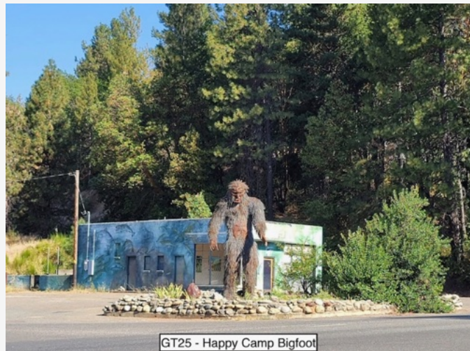
GT25 - Happy Camp Bigfoot