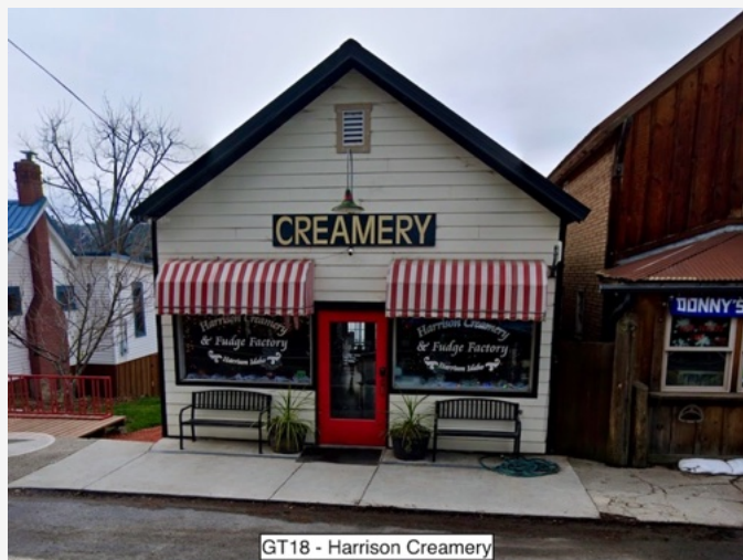
GT18 - Harrison Creamery

We wanted to get you over on the east side of Lake Coeur d'Alene and this will accomplish that goal. And you get ice cream. Win win!