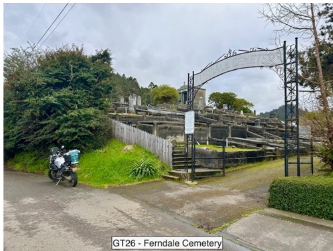
GT26 - Ferndale Cemetery