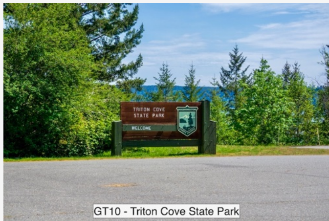
GT10 - Triton Cove State Park

We have wanted to include a stop on the Hood Canal for a while. There is a cool 2-ish hour loop around Hood Canal from Bremerton that a frequent part of any summer ride for those living nearby. Stop for refreshments in Hoodspout and enjoy the easy day!